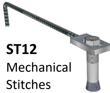
ST12 Mechanical Stitches