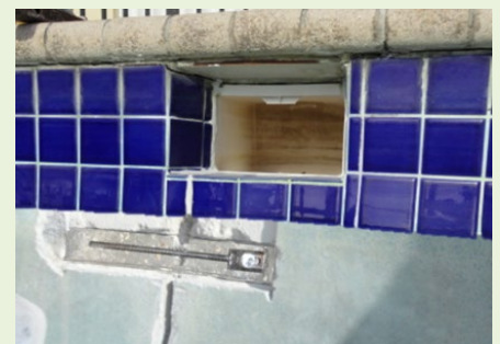
FULLY STABILIZED FRACTURE

For guidance on difficult applications or for answers to simple questions, call your local TorqueStitch Dealer or call TorqueStitch direct to speak to a Specialist. Our Engineering Team is always available to provide support.